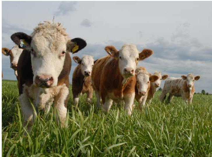
Simmental young stock, enjoying the lush early grass of the Ouse Washes; owned by Rob Fletcher