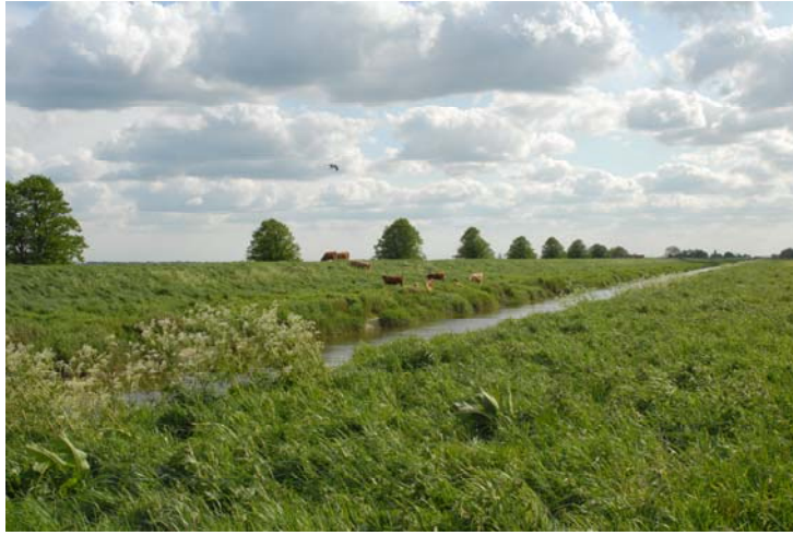
Simmental heifers and bull grazing one of the many riverbanks associated with The Ouse Washes; owned by Rob Fletcher.