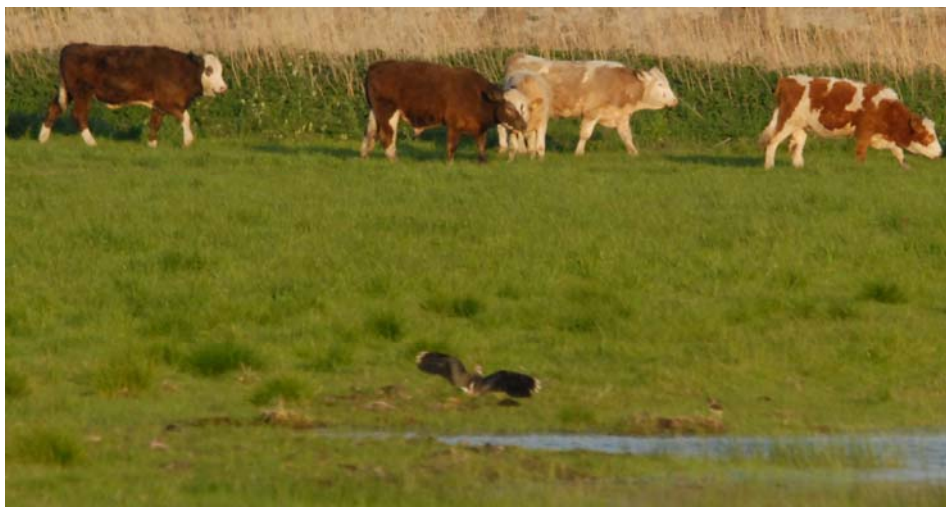
A lapwing with one of her chicks (just visible, 1 meter to her right) benefiting from the RSPB Pilot Project