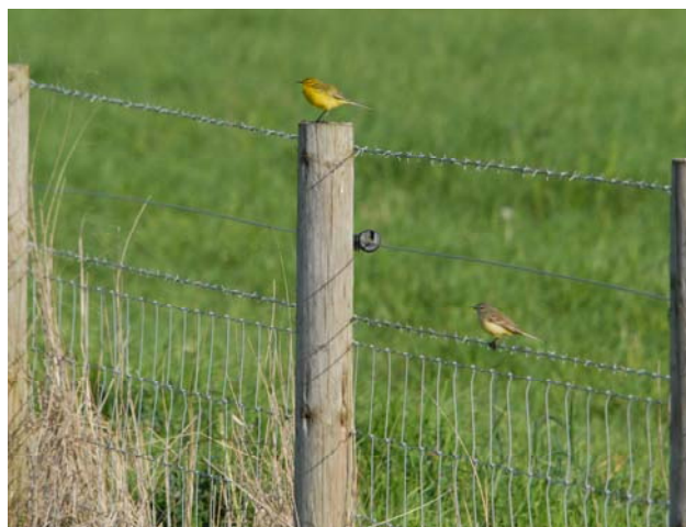
Yellow wagtails (male and female) recently returned from Africa, sitting on the fence of recently created nature habitat, on John Fletcher's farm.