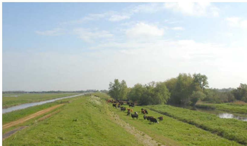
Limousine Cows and calves grazing one of the many riverbanks associated with The Ouse Washes; owned by Roger Turner.