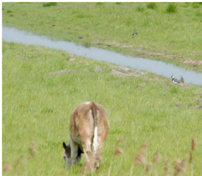
A John Fletcher owned steer, lush wet grassland, open water, two lapwings and one redshank, farming and nature in harmony.